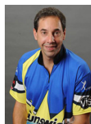
Parker Bohn III